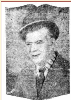
In Sunny (1927) Truth (Sydney) 29 May 1927, 11.