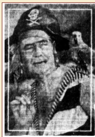
Truth (Sydney) 3 June 1934, 25.