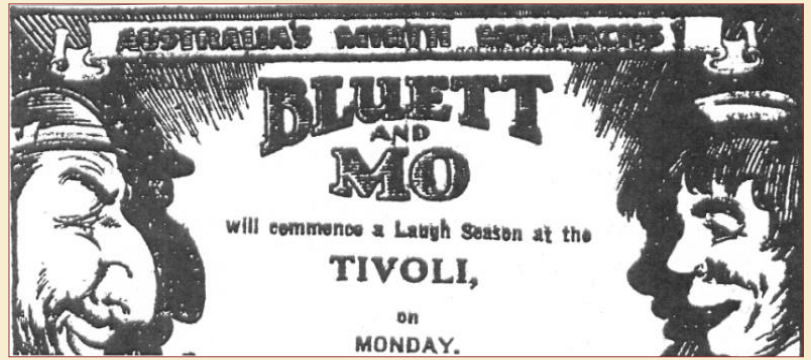
Brisbane Courier 26 June (1926), 2.

Bluett and Rene teamed up in May 1926 after separately joining J.C. Williamson's Tivoli Celebrity Vaudeville. They made their debut in Sydney on 10 May in a 30 minute nautical sketch written and directed by Bluett. Rene played an Admiral and Bluett a sailor. Although popular from the start in Sydney the pair initially fared less well in Melbourne with the view being that their personalities and comedic style were too diverse. A second sketch, "The Fashion Plates," was first introduced midway through their first Melbourne season. During their nine