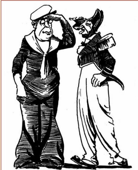
Yo, ho, mates, Fred Bluett and Roy Rene (Mo), who will rock the Tivoli with laughter on Monday.